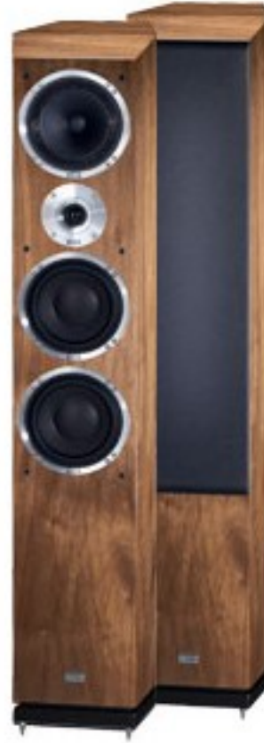
Walnut Real Wood Veneer