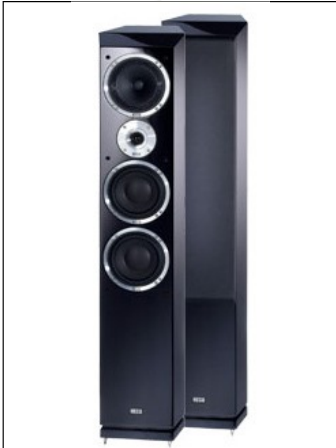
High Gloss Black Paint