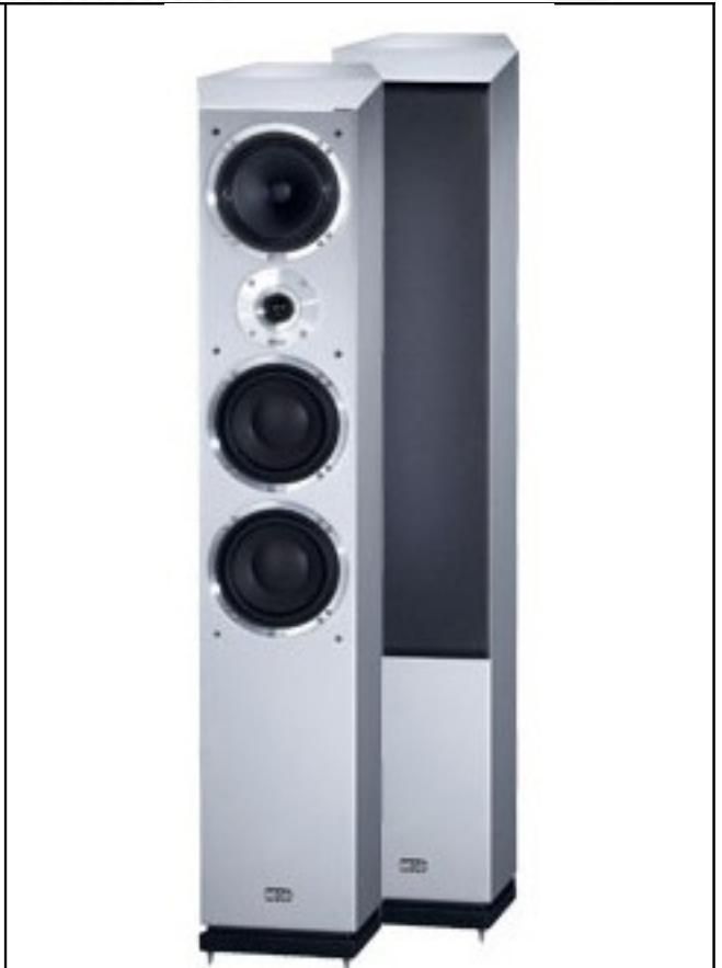
High Gloss Silver Paint