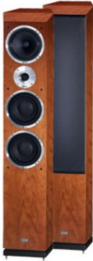
Cherry Real Wood Veneer